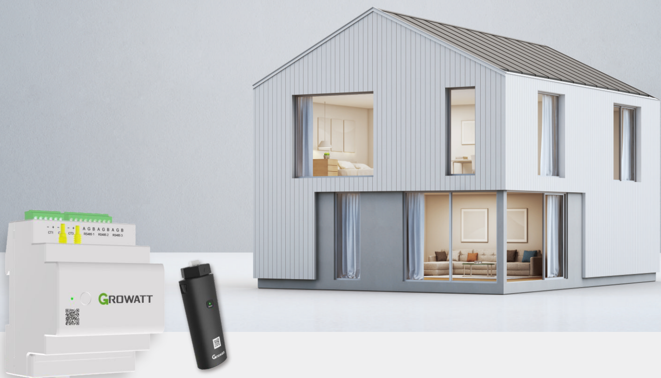
GroHome System Diagram